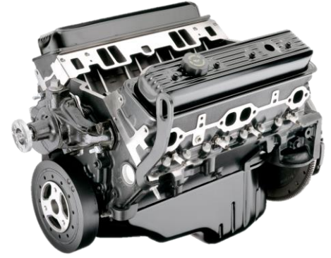
GM Powered Solutions 5.7L V-8, L31 Shown Water pump not included

GM Powered Solutions offers our 5.7L V-8 engine with its cast-iron block and cylinder head to help deliver excellent performance and durability. The Industrial version follows GM's original robust truck performance and runs on regular gasoline. For alternative fuel options, a compressed natural gas (CNG) and liquid propane (LP) version is available by one of GM Powered Solution's approved integrators.